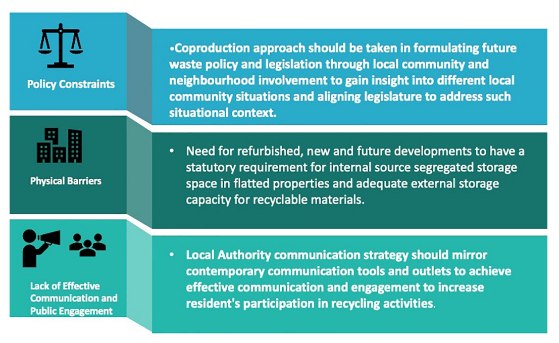
Figure 4. Main barriers of households recycling and potential solutions.

to educate the younger generation about the benefits of recycling. Also, more importantly, to prepare the youth for future sustainable living.