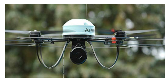
Figure 3. AirRobot's AR100-B.