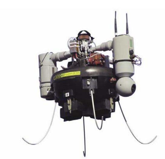
Figure 11. T-Hawk MAV from Honeywell Inc.

The T-Hawk system consists of two UAVs together with a Ground Control Station (GCS). In Feb 2009, it was reported that the UK MoD had placed a US$5.7m order to buy six of these systems for use in frontline operations. The US Navy placed an order for 90 systems worth US$65m in Nov 2008.