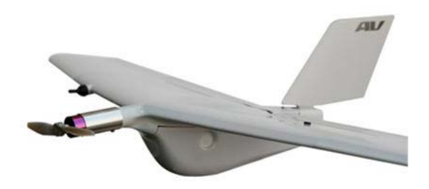
Figure 10. AeroVironment's Wasp III.

Since the wars in Afghanistan and Iraq began in 2001 and 2003 respectively, the world has witnessed an increasing number of unmanned aerial vehicles entering the battlefield. To date, these number in the low thousands. The current batch of small manportable drones almost entirely consists of fixed winged systems such as the Lockheed Martin Desert Hawk III and the AeroVironment Wasp III. However, these are beginning to be supplemented by VTOL UAVs which can hover and stare, such as the Honeywell T-Hawk system, which is just about to enter service with the US and UK armed forces.