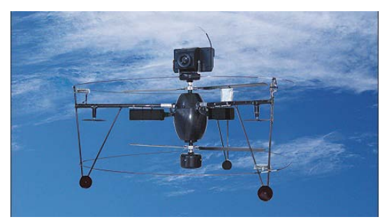
Figure 1. EMT-Penzberg's Fancopter.

Ascending Technologies (AscTec) and Middlesex University have been developing multiple rotarywinged UAVs (more than one rotor) and these are now starting to enter the military and civilian markets with great success.