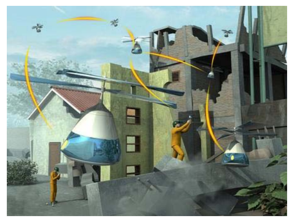
Figure 12. The muFly vision of future NAVs.

The US Government's NAV R&D effort is being driven by DARPA [6] who are funding work at AeroVironment Inc. The Harvard group is being funded via a US$10m National Science Foundation research grant over the next five years [7].