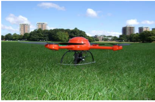
Figure 4. Microdrones' md4-200.