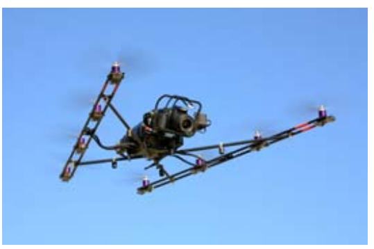
Figure 8. AscTec's Falcon 8.