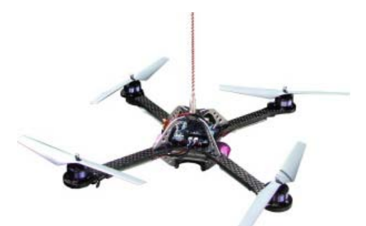
Figure 2. AscTec's Hummingbird.