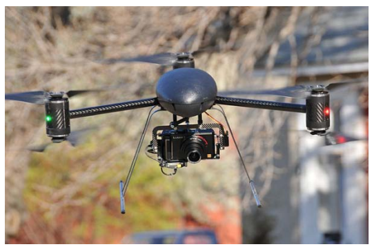
Figure 6. Draganflyer X6 co-axial tri-rotor.