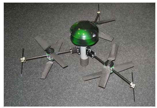
Figure 5. AirRobot's AR70 co-axial tri-rotor.