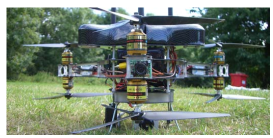
Figure 7. Middlesex University's co-axial tri-rotor.