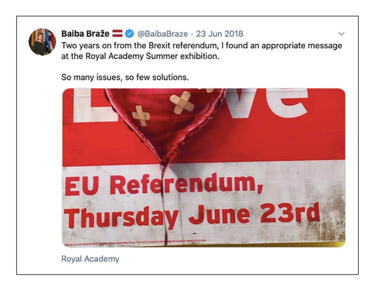
Figure 2. Example of a Brexit tweet with expressed opinion and negative evaluation. Tweet by Ambassador of Latvia to the UK, Baiba Braže.