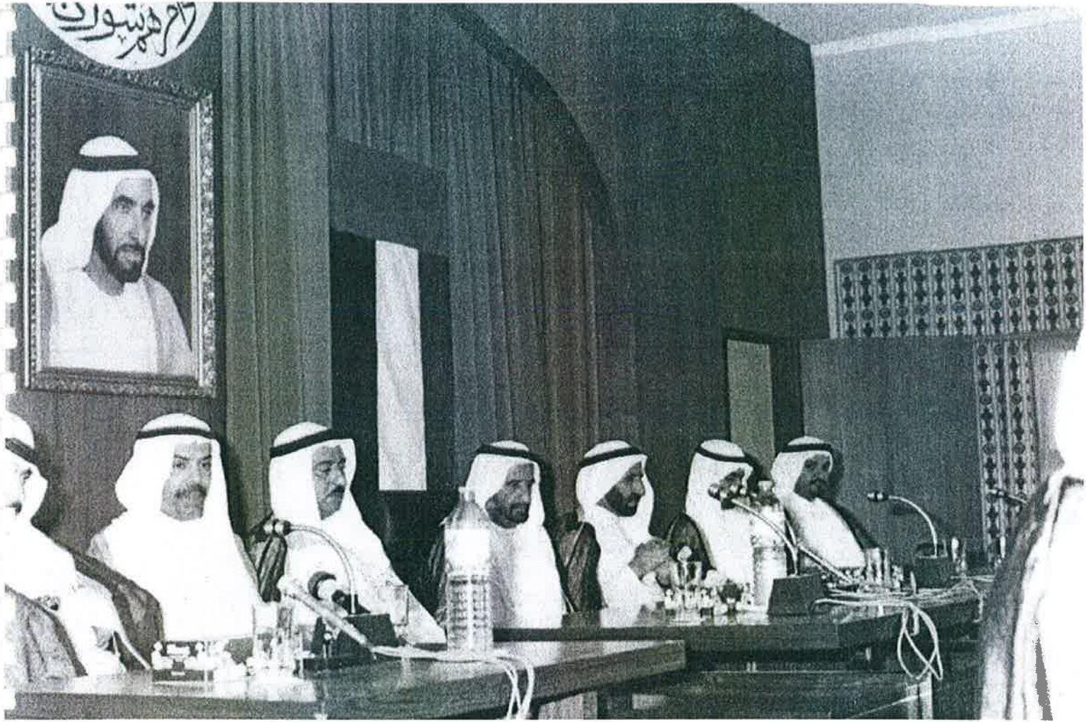
The Rulers of U.A.E sitting in the F.N.C.