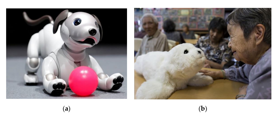
Figure 1. (a) AIBO robot [23] (b) Paro robot [10].

In 1993, the Japanese company called Advanced Integrated Scanning Tools for Nano Technology (AIST) developed a companion robot called Paro (cf. Figure 1). It was designed to look and behave like a baby harp seal [10]. Paro has tactile, light, audition, temperature and posture sensors that can recognise light/brightness and darkness, and understand when it is being held. Paro can also recognise its name, greetings, praise and what direction sounds are coming from. It also learns how users would like it to behave using the tactile sensors. When users stroke Paro, it attempts to remember what it did to make the user stroke it, and if the user hits Paro, then it will attempt to remember what it did to make the user hit it and not do that again [21]. It responds to users through the various body movements, through seal-like sounds and facial expressions [22].