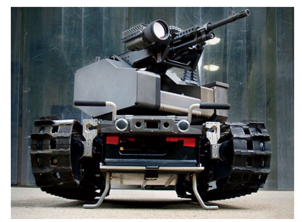
Figure 7. Foster-Miller MAARS.

Another new system currently being offered is Foster-Miller's latest version of the TALON platform. It is called the Modular Advanced Armed Robotic System (MAARS) as seen in Figure 7, which is a reconfigurable system offering multiple mission payloads; meaning that it can be used for more than just a weapons platform. It has a stronger chassis, is heavier but faster and includes the option of a manipulator arm together with more weapon capabilities. Foster-Miller also offer a much smaller UGV (which can be seen as a competitor to the Packbot) known as the Dragon Runner, developed to offer the user a vehicle that can go and look into areas that the TALON cannot.