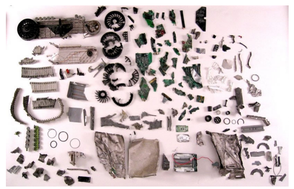
Figure 1. Destroyed Military UGV.

and they are used to carry out some of the most critical missions because the warzone is one of the most hostile environments on the planet and if a robot can replace a soldier and gets damaged or destroyed then it is a far smaller price to pay than to risk a human life as seen in Figure 1 below.