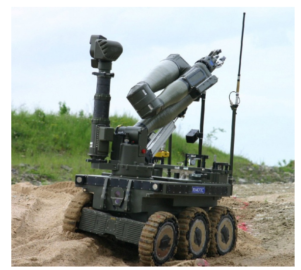
Figure 5. Remotec Cutlass.

The first example of the new generation of UGV's is Remotec's Cutlass (see Figure 5), which offers greater speed and accuracy compared to its counterpart. On this vehicle they have opted for a sixwheeled chassis instead of tracks which offers greater speed, mobility and efficiency. The system also includes an intelligent manipulator arm which has 9 degrees of freedom and includes a tool rack so that the operator can remotely select from a range of end effectors, offering greater payload options in the field. Remotec have won a £65 million contract to supply 80 Cutlass units by 2010 to the U.K. Ministry of Defence (MoD), who will use them for antiterrorism operations worldwide [7].