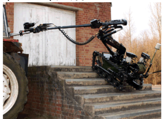
Figure 2. Remotec Wheelbarrow Revolution.

Remotec's Wheelbarrow Revolution (see Figure 2) is one of the most successful UGV's used for EOD. The Wheelbarrow was first developed (from a lawnmower and a wheelbarrow, hence the name) by Lieutenant-Colonel Peter Miller to help British Army bomb disposal teams during the 1970's while operating in Northern Island to neutralise the Irish Republican Army (IRA) [4].