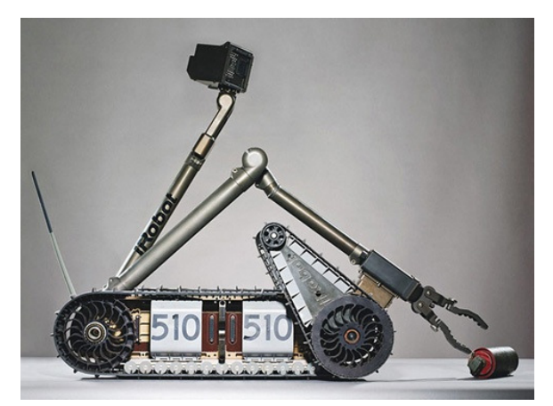
Figure 3. iRobot Packbot.

Alongside EOD robots are another breed of rugged, highly capable UGV's used mainly in warzones by the U.S. Army who need to be able to look and operate in unsafe or unreachable areas such as caves in Afghanistan or cluttered urban cities in Iraq. The most famous of these is the man-portable Packbot developed by iRobot (see Figure 3), which has become the most successful UGV used by today's military with more than 2,500 systems currently in service in Iraq and Afghanistan. Many orders have been placed worldwide for this highly capable system and iRobot have many large contracts, the most recent being a US$6.1 million contract to supply spare parts to the U.S. Army [5].