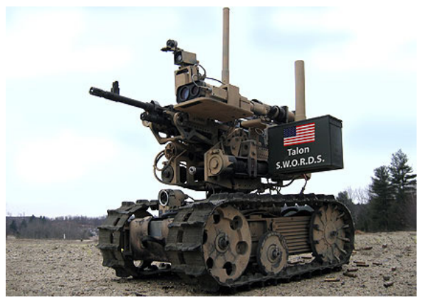
Figure 4. Foster-Miller Talon.

system [6]. These systems are currently being deployed in warzones to carry out tasks such as guarding and patrolling front line buildings from attack.